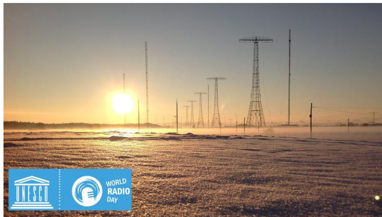
The Alexanderson multiple antenna in the sunset.

The theme for the 12th edition of the World Radio Day, to be celebrated on February 13th 2023, is " Radio and Peace ".